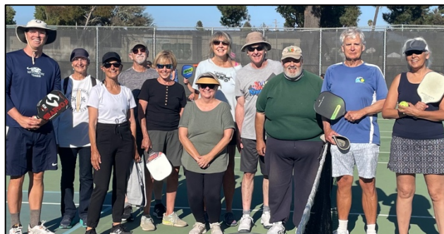
Pickleball Class on August 18, 2022